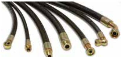
Hydraulic / Pneumatic Hose Assembly