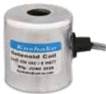
Solenoid Coil 24 VDC / 230 VAC