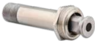
Core Tube + Plunger Assembly