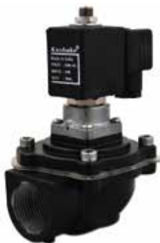
3/4" - 2" BSP (F) Pulse Jet Valve