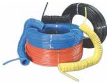
Coil Hose PU Tube