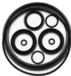
Up Down / In Out / Hood / MTC / Brake / Lock Cylinders