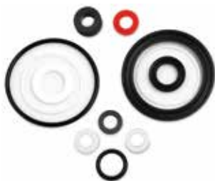
Seal Kit Control Valve 20 NB / 25 NB