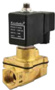
1/2" - 2" BSP (F) Diaphragm Solenoid Valve