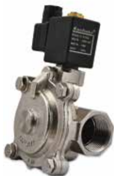
1/2" - 2" BSP (F) S S Diaphragm Solenoid Valve