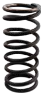
Spring for Bottom Hood Cylinder