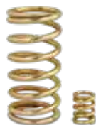
Control Valve Spring Set