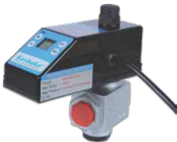
1/2" - 1" BSP (F) Automatic Drain Vale